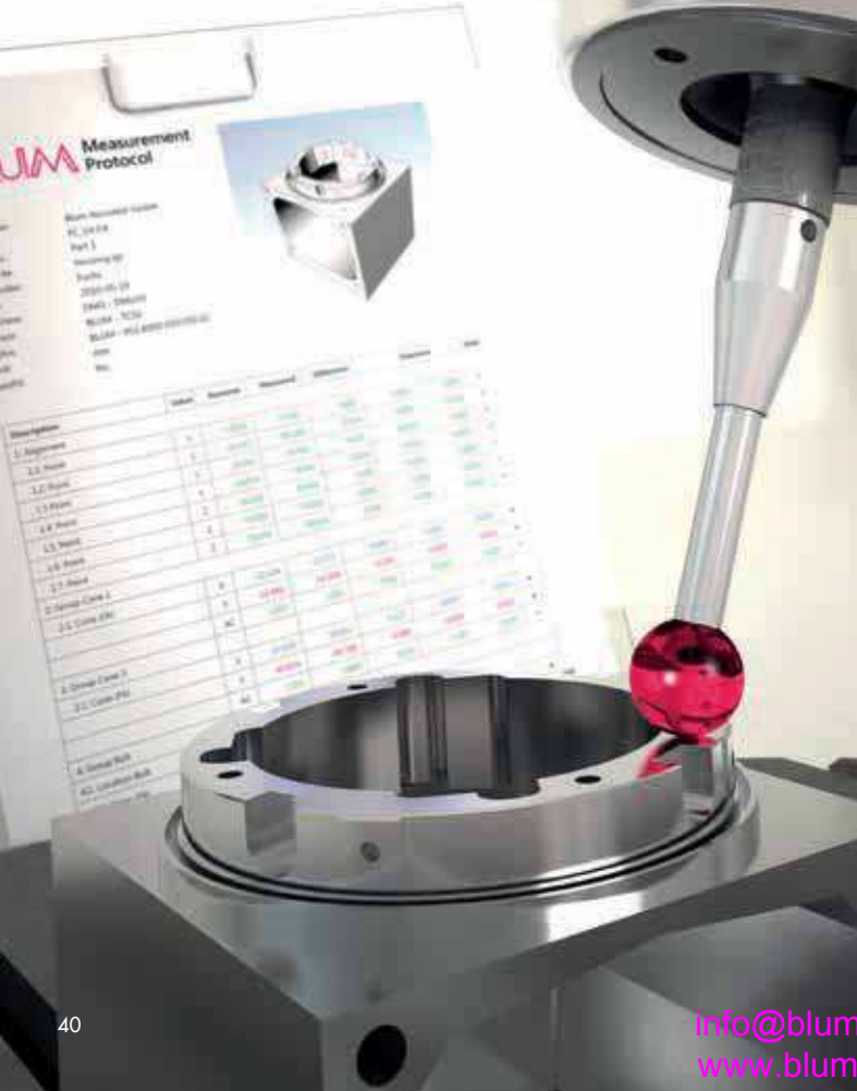
Measuring & evaluation of standard geometries