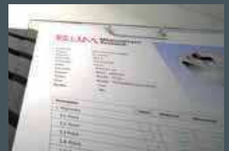
Compiling measurement reports