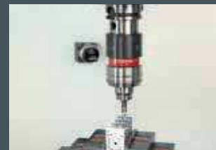
Pneumatic component: Diameter